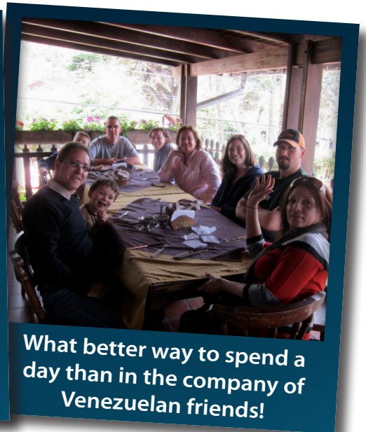
What better way to spend a day than in the company of Venezuelan friends!

Caracas. This is their vision in reaching Caracas for Christ. As we continue to seek God's heart for specific direction as to the where and how, we are also praying that we will be an encouragement and blessing to the people passionately serving God and their people. We have had pastors ask us for our help and we have had young adults asking us to share our experiences with them because they one day want to be pastors. This is both humbling and encouraging and sometimes overwhelming as we of-